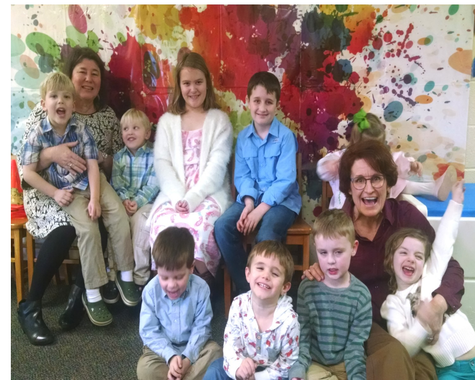
Lenten Adventure (ages 3—5th grade)