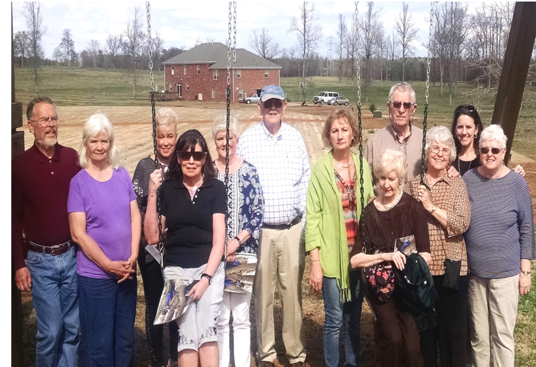
Forever Young at the Boys Farm