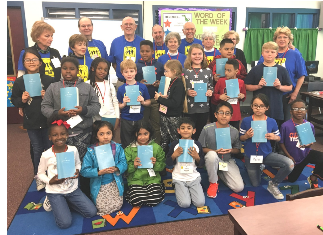
Good News Club at Boundary Street School

1211 Calhoun Street, Newberry, SC 29108 (803)276-3534 aveleighchurch@yahoo.com www.aveleigh.org March 18, 2018