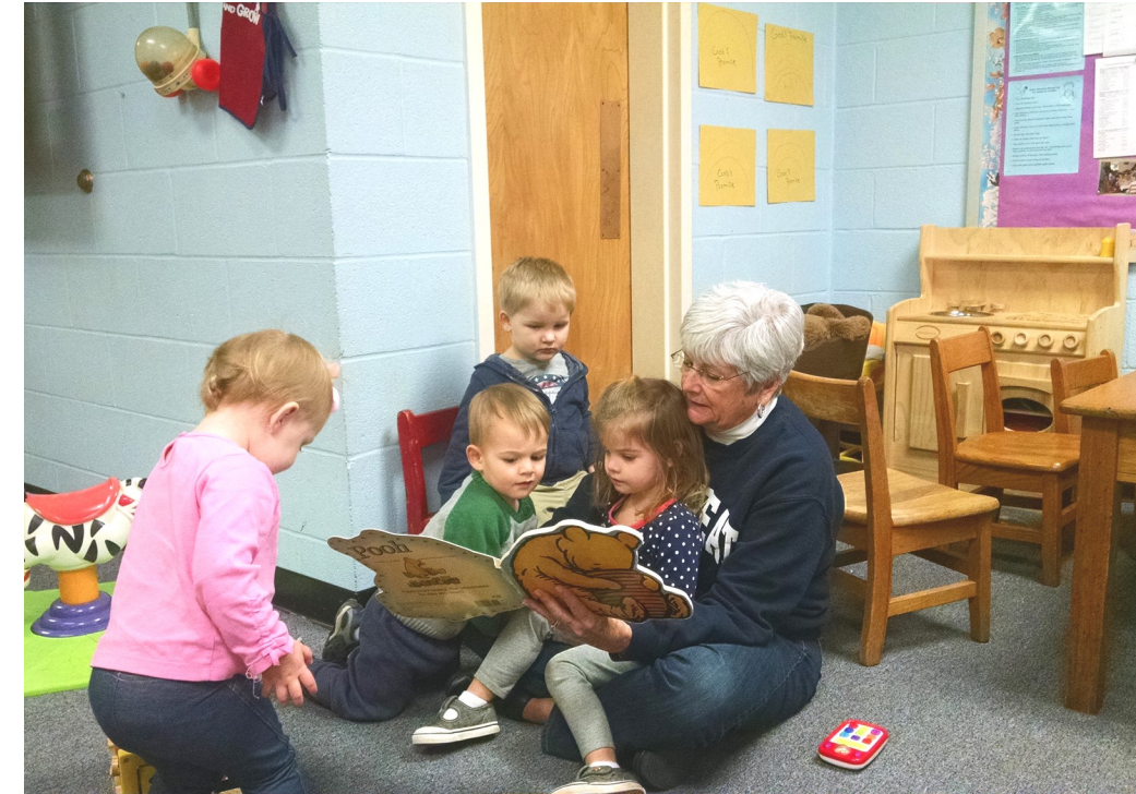
Mother’s Morning Out

1211 Calhoun Street, Newberry, SC 29108 (803)276-3534 aveleighchurch@yahoo.com www.aveleigh.org March 25, 2018