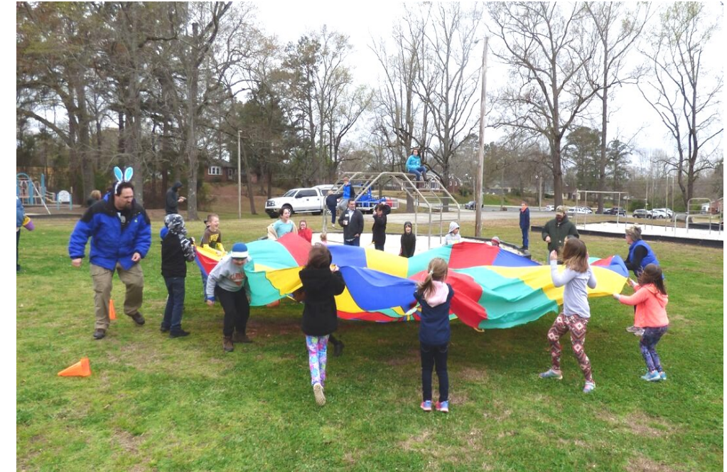
Aveleigh’s Easter Party at Mollohon Park

1211 Calhoun Street, Newberry, SC 29108 (803)276-3534 aveleighchurch@yahoo.com www.aveleigh.org April 1, 2018