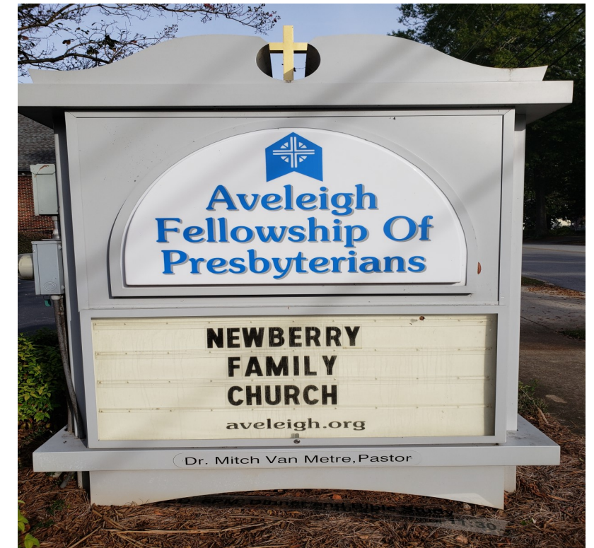
Aveleigh's 2019 Stewardship Program